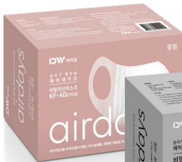
3D type (Medium)

Easy and hygienic usage of individual piece.