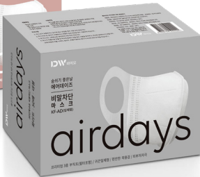
3D type (Large)