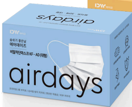
General type (Large)