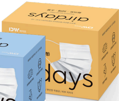
General type (Small)